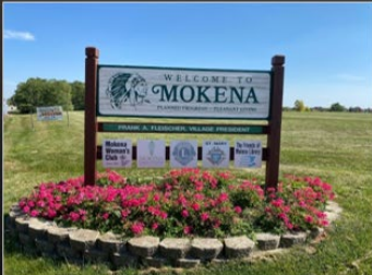
Schoolhouse & Francis Rd.