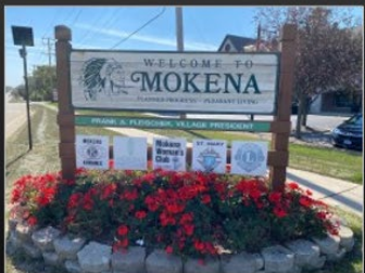
187 th & Wolf Rd.