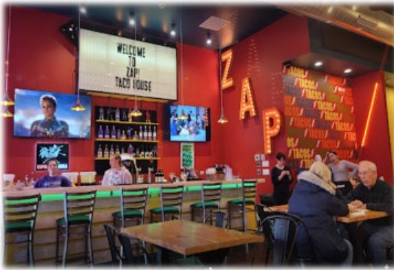
EXHIBIT "D" - APPROVED HOURS OF OPERATION