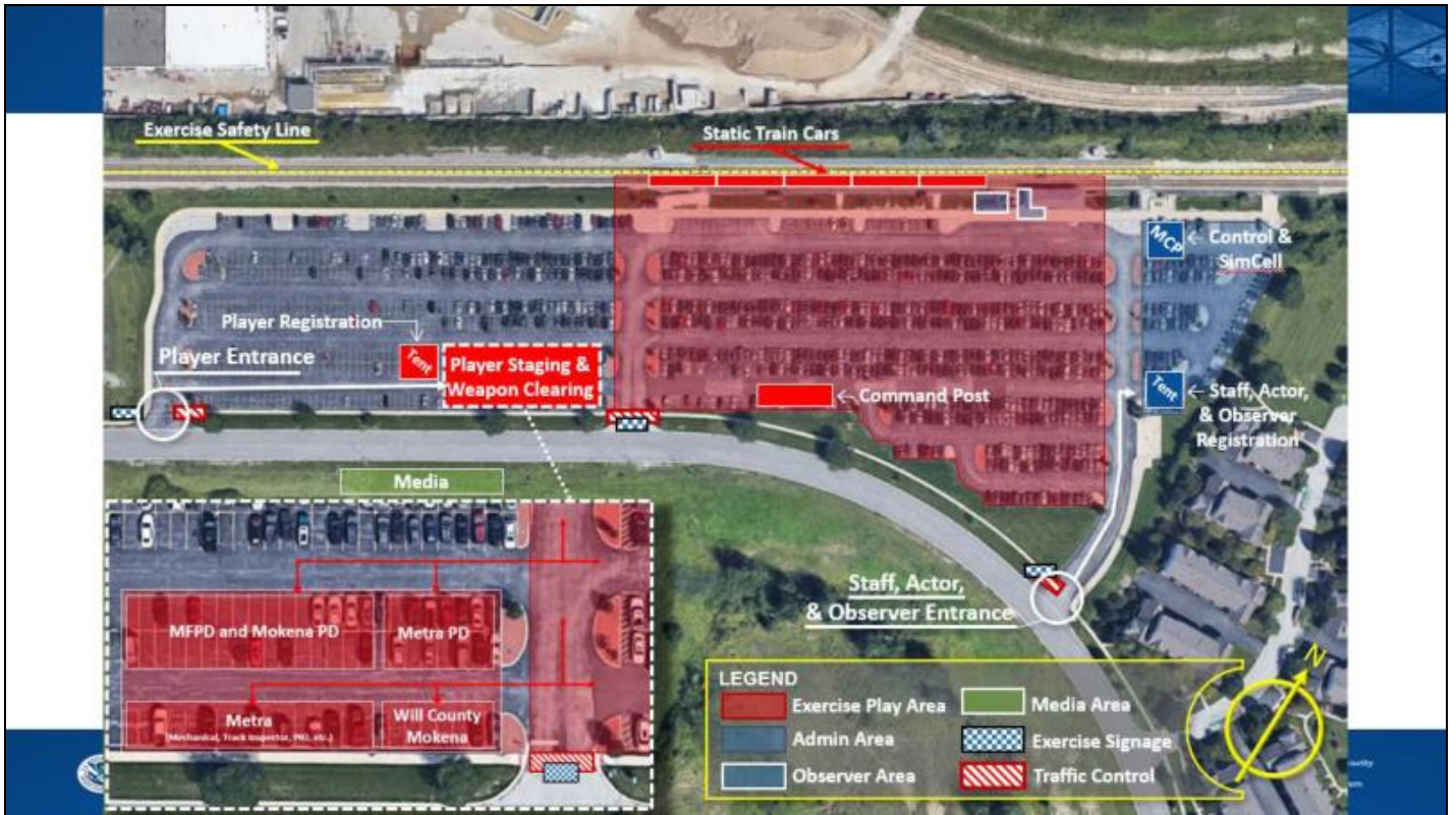
Table-Top Exercise (TTX)